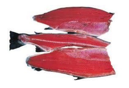
PROCESSING Gutting; scaling, skinning, heading and tail-off; filleting