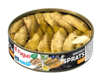
CANNING Canned fish production Cans: steel, aluminum, glass, pouches