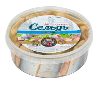
PRESERVATIVES Fish and fillets in different dressings Jars: glass, plastic