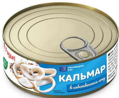
Squid in own juice 240g