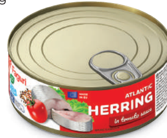
Herring in tomato sauce 240g