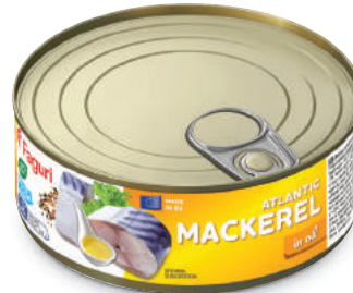
Mackerel in oil 240g