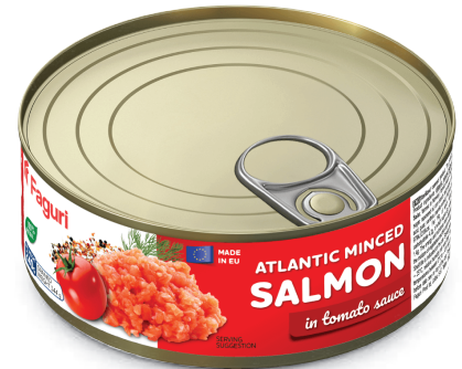
Atlantic minced salmon in tomato sauce 240g