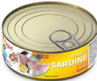
Sardine in oil 240g