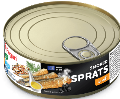
Smoked sprats in oil 240g