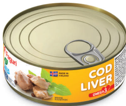
Cod liver 230g