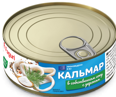
Squid in own juice with dill 240g