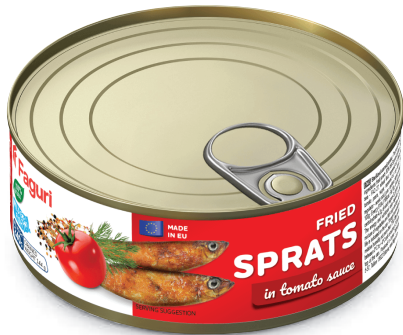
Fried sprats in tomato sauce 240g