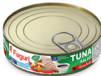
Tuna salad in Asian taste 160g