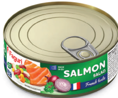
Salmon salad in French taste 240g