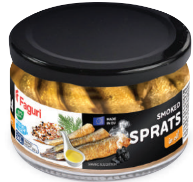
Smoked sprats in glass 250