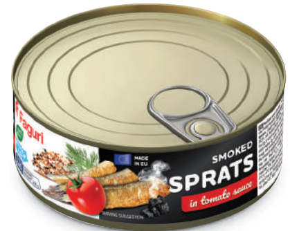
Smoked sprats in tomato sauce 240g