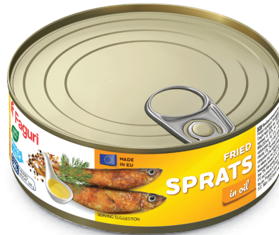
Fried sprats in oil 240g