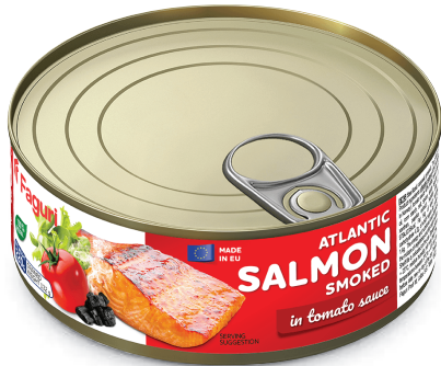
Smoked Atlantic salmon in tomato sauce 220g