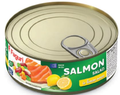
Salmon salad in lemon taste 240g