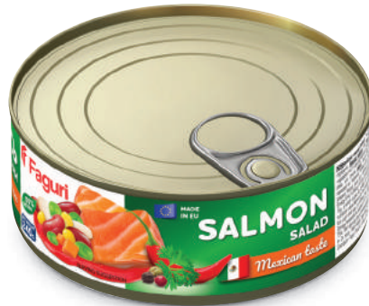
Salmon salad in Mexican taste 240g