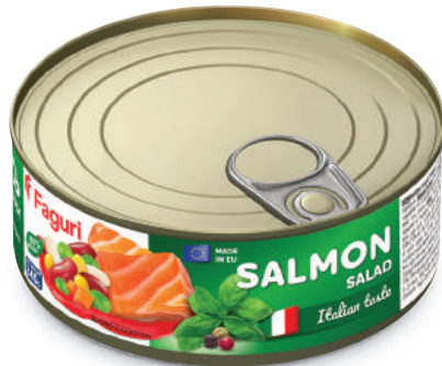
Salmon salad in Italian taste 240g