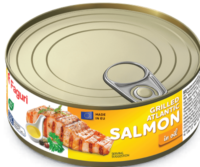
Grilled Atlantic salmon in oil 220g