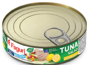
Tuna salad in lemon taste 160g