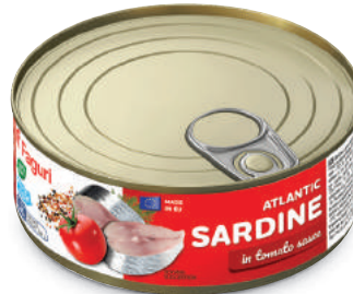
Sardine in tomato sauce 240g