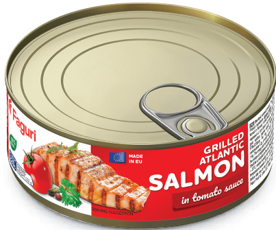
Grilled Atlantic salmon in tomato sauce 220g