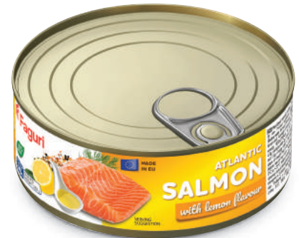
Atlantic salmon with lemon flavour 240g