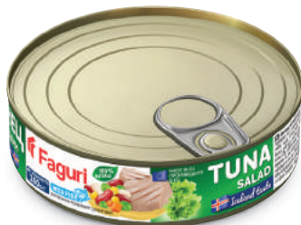
Tuna salad in Iceland taste 160g