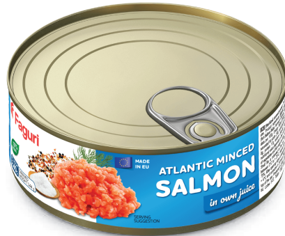
Atlantic minced salmon in own juice 240g