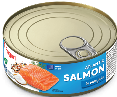
Atlantic salmon in own juice 240g