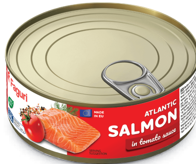
Atlantic salmon in tomato sauce 240g