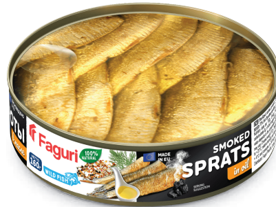
Smoked sprats in oil 160g PeelOff