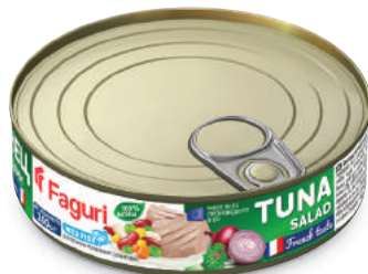
Tuna salad in French taste 160g