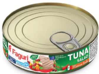
Tuna salad in Mexican taste 160g