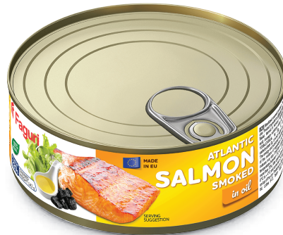
Smoked Atlantic salmon in oil 220g