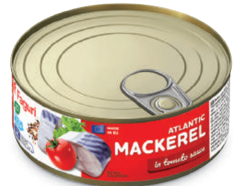
Mackerel in tomato sauce 240g