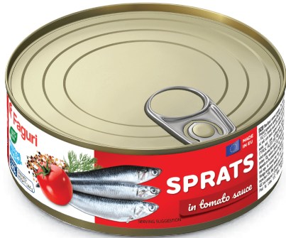
Sprats in tomato sauce 240g