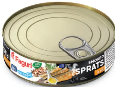
Smoked sprats in oil 160g