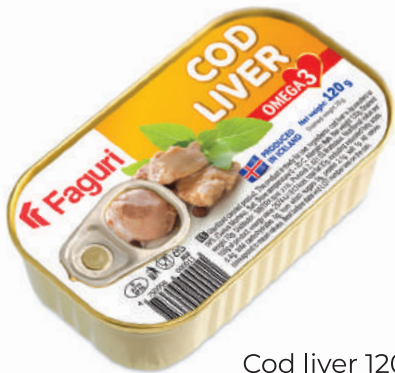
Cod liver 120g