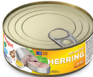
Herring in oil 240g