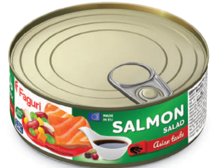
Salmon salad in Asian taste 240g