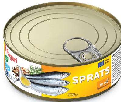
Sprats in oil 240g